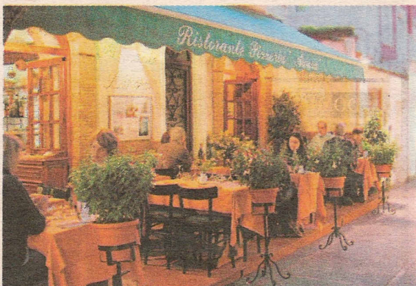
Dine al fresco at Aurora, located in charming Capri.

Must have: Start with the grilled mozzarella on lemon leaves ($11).