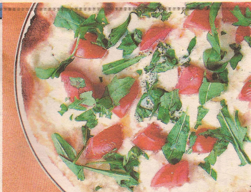
It's all about the pizza at the historic Aurora restaurant, dating back to 1912.