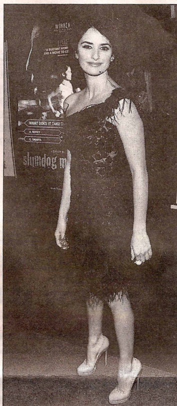
"It's a tough crowd": But Penelope Cruz won them over in Vicky .